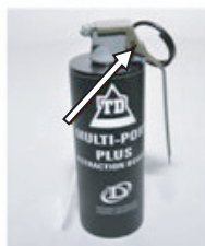
Uninstall handle and safety key.