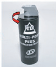
Roll the upper body anticlockwise to open the body