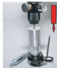
Insert CO2 for 5~7 seconds