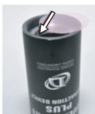
Install the phonation slice (do not install too tight)