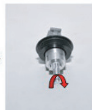
Adjust the switch to control the time of explosion (Clockwise - extend the time and vice versa.