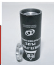
After complete will same as this picture.