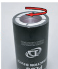
Use the key to assemble the bottom covers.