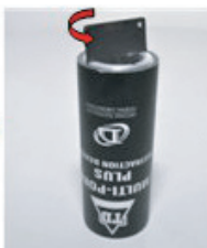
Use the key to disassemble the bottom covers.