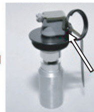
Insert handle and safety key and assemble the body by rolling the upper body clockwise.