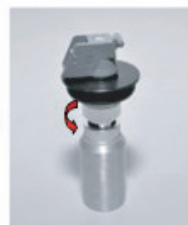
Disassemble the body by rolling the upper body anti-clockwise