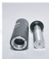
Assemble the last piece of outer covers.